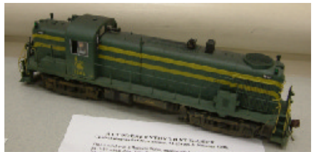
Ed Bommer - O Scale