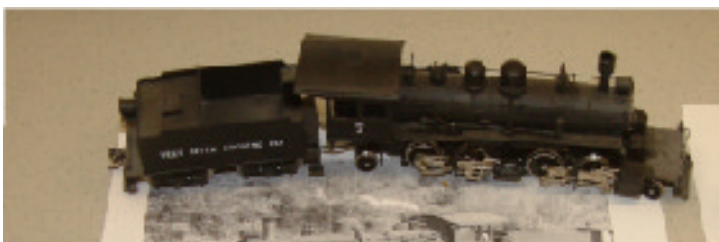
Dave Salamon - HO Scale