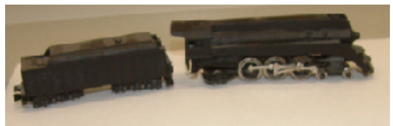
Dave Salamon - N Scale