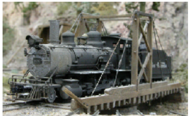
Dave Steensland - HOn3 Scale