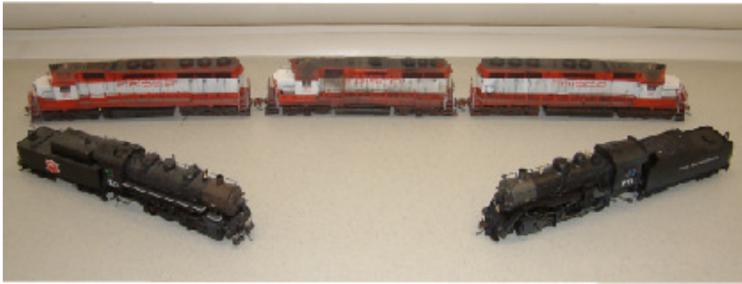
Glen Young - HO Scale