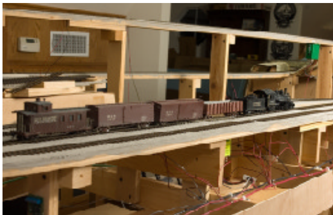
The first train runs from Placerville to Ridgeway.

At this time the layout is far from complete. The mainline is complete, and there are passing tracks in Placerville, Vance Jct., and Ophir. The branch line to Telluride and all tracks in the town were recently completed. Neither the Ridgeway nor Rico yards have been built yet, so no operations are underway yet. All motive power has been converted to DCC, and the layout is operated with a wireless NCE system. There is no finished scenery yet, but the hardshell is nearly complete in Ophir, and mock-ups of the main buildings in town are in place. The most recent project is final planning of the main scenery contours from Ophir to Butterfly so that the hardshell can be put in those areas now that the tracks to Telluride have been completed.