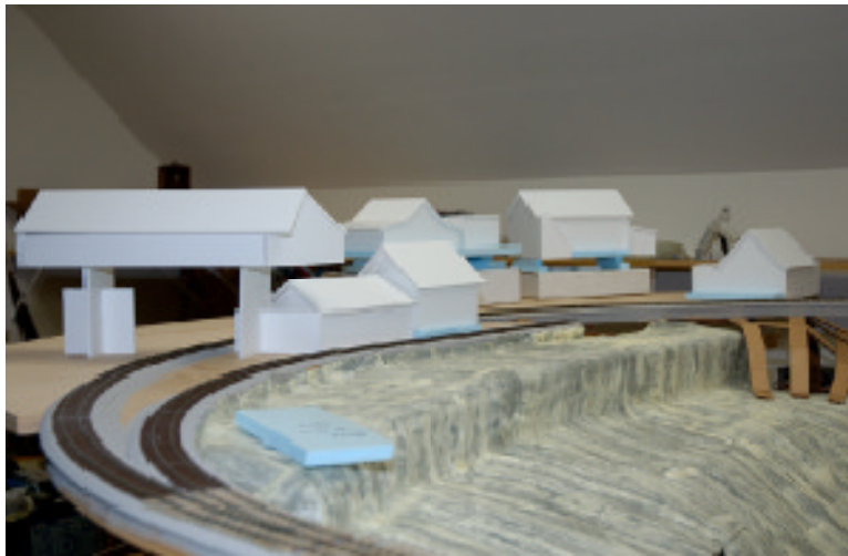
Mock ups of all major buildings are in place to help establish location and terrain contours.

I am modeling the Northern division of the Rio Grande Southern (RGS), from Ridgeway to Rico, in S n 3. Most of the equipment is dated from the 1940's, reflecting what can still be seen in Colorado today, but I have intended to operate the railroad with traffic from the 1920's. I have tried to plan the layout for some operations while still preserving the narrow gauge look and feel. The track plan allows for continuous running via a helix, but the helix will be off limits during operating sessions, resulting in a point to point scheme.