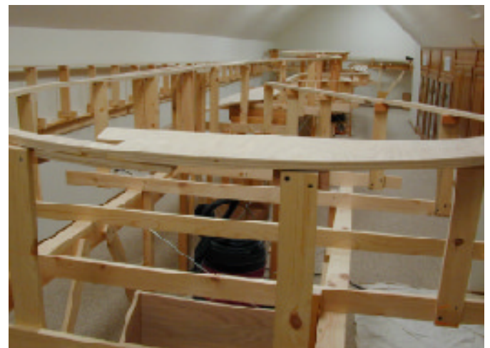
Sub -roadbed in Ophir on risers.